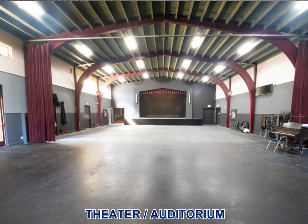
THEATER / AUDITORIUM