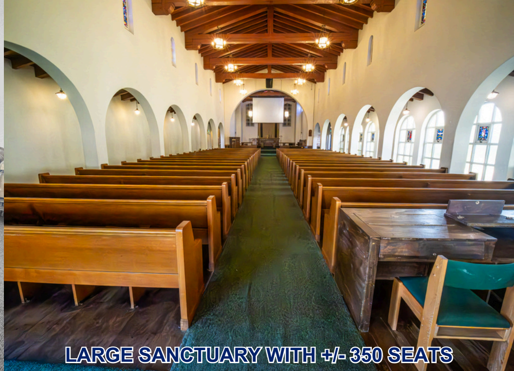
LARGE SANCTUARY WITH +/- 350 SEATS