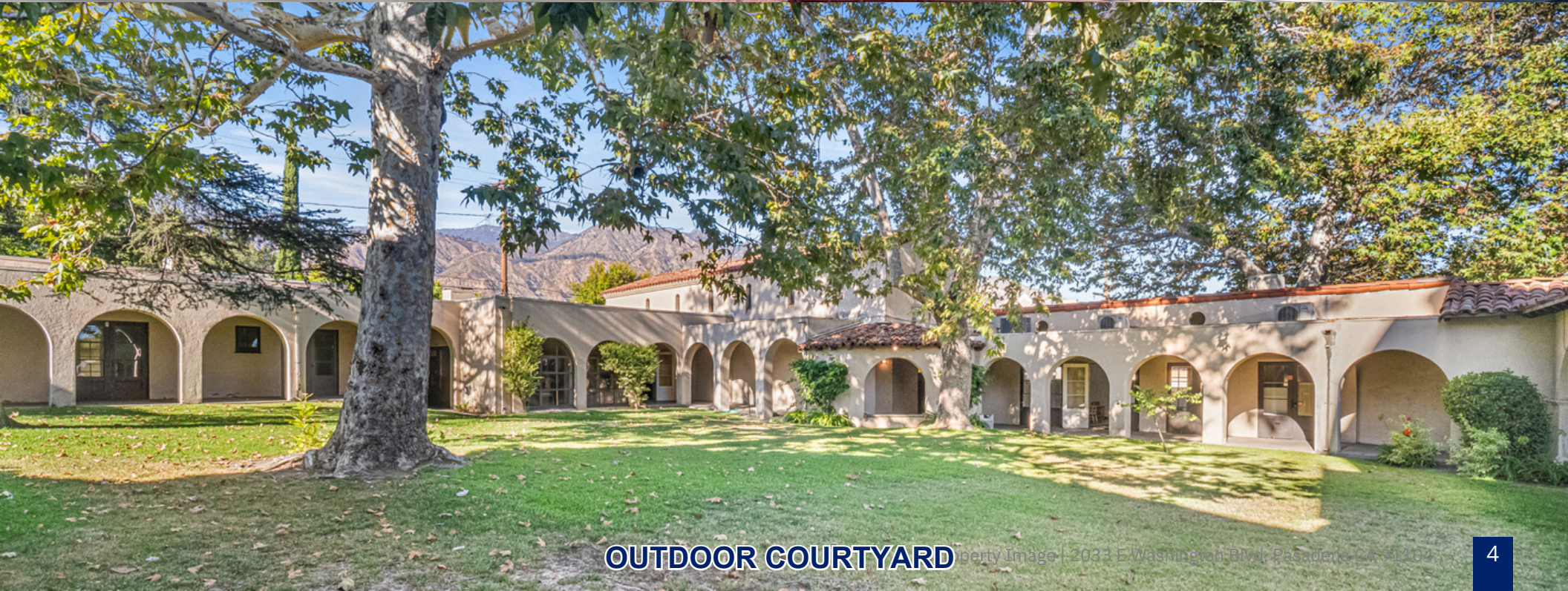
OUTDOOR COURTYARD Property Image | 2033 E Washington Blvd., Pasadena, CA 91104