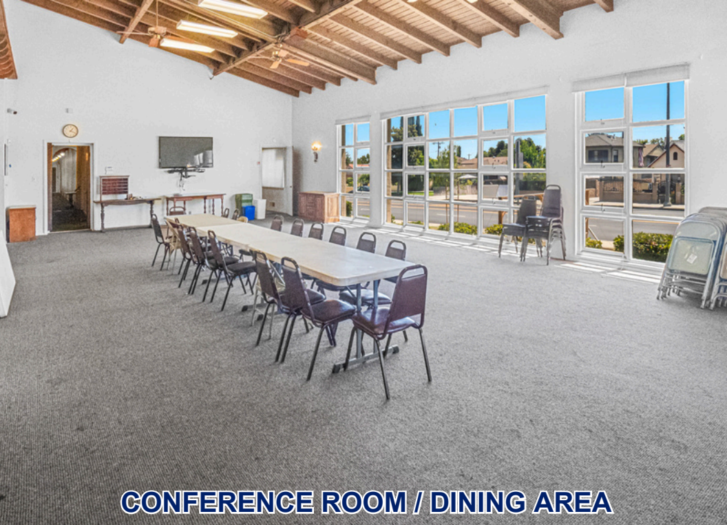
CONFERENCE ROOM / DINING AREA