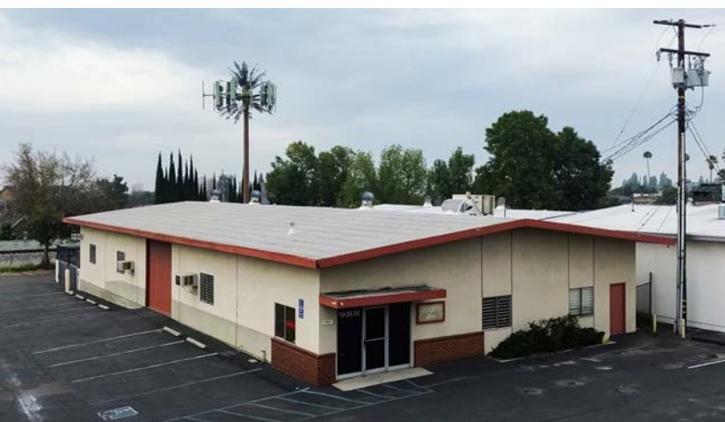
996 W. 9TH STREET