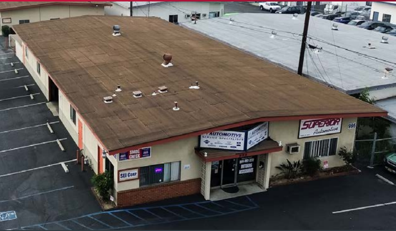
996 W. 9TH STREET