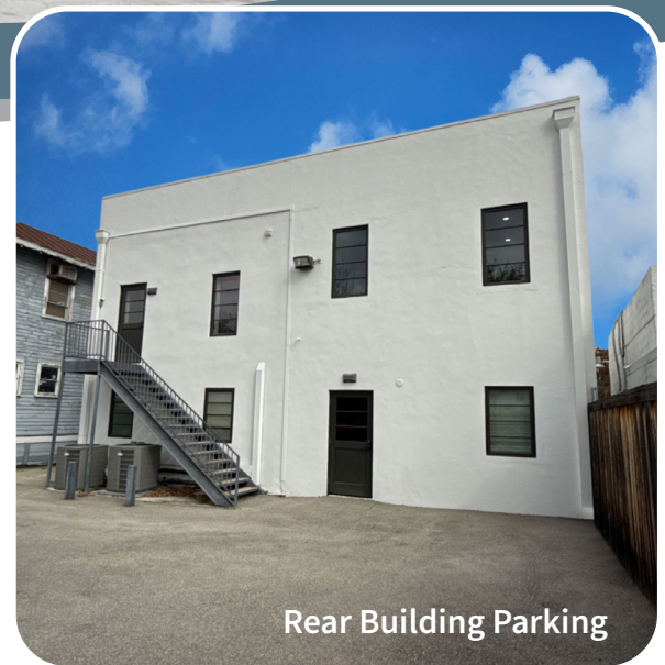
Rear Building Parking