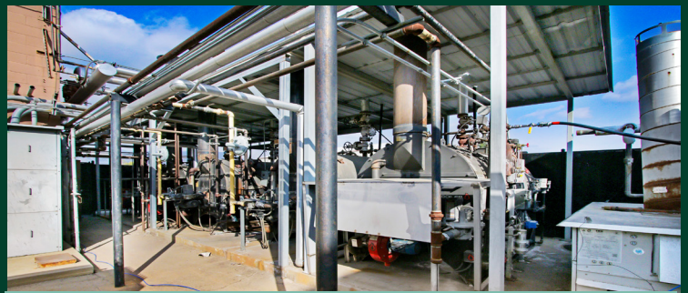
Boiler & Process Infrastructure