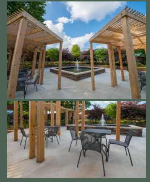
- Central courtyard with an outdoor lounge and patio seating