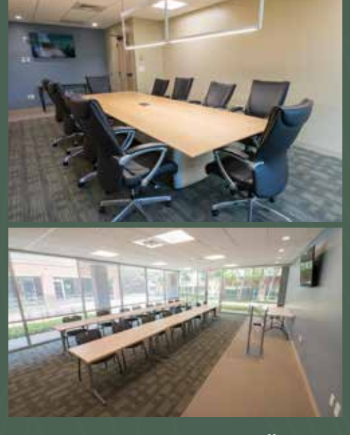
- Leasing & management office - Conference centers & training facility