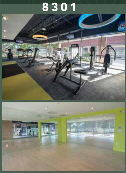
- Fitness center with private lockers, yoga studio and showers