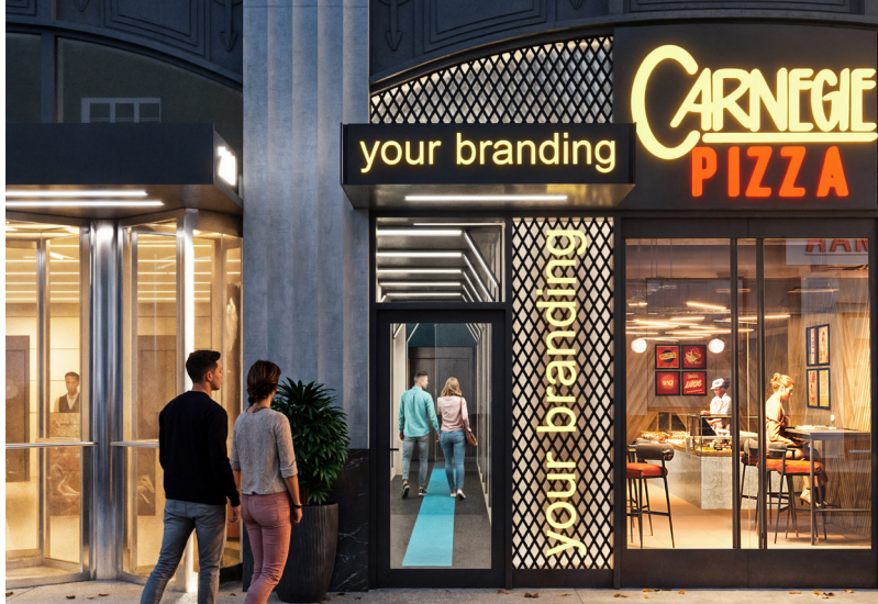
FREIGHT ENTRANCE CONCEPT: