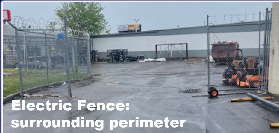
Electric Fence: surrounding perimeter