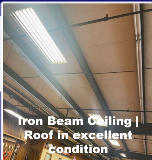
Iron Beam Ceiling | Roof in excellent condition