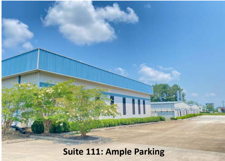
Suite 111: Ample Parking