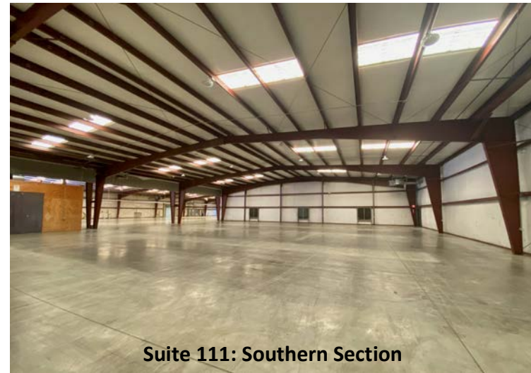
Suite 111: Southern Section

Information deemed reliable but not guaranteed.