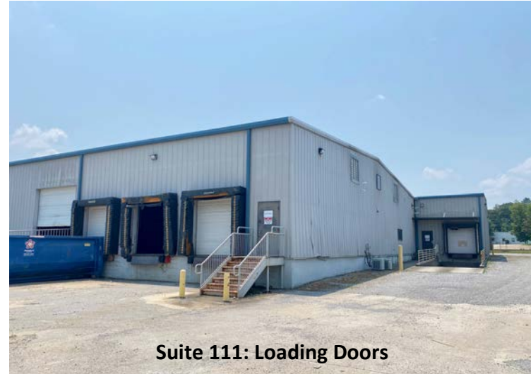
Suite 111: Loading Doors