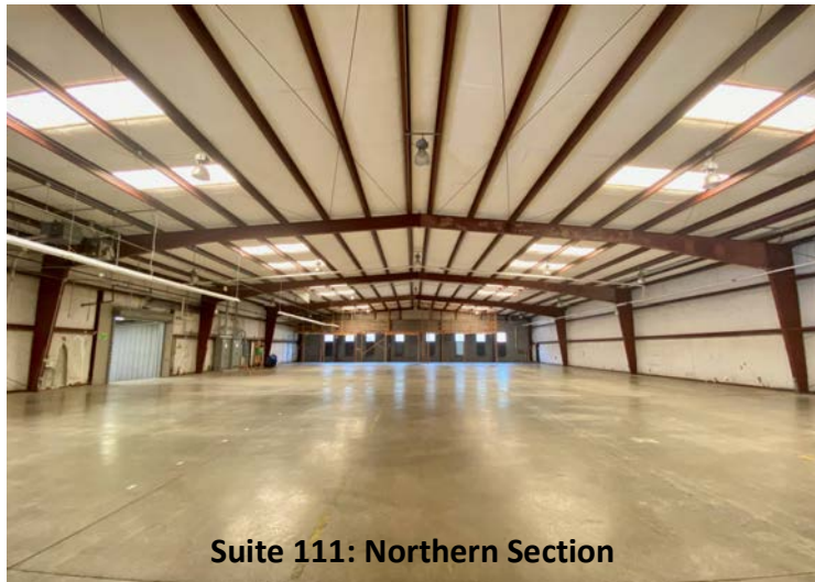
Suite 111: Northern Section