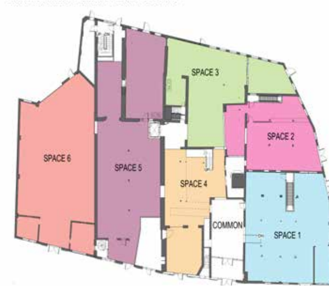
FIRST FLOOR | rental square footage