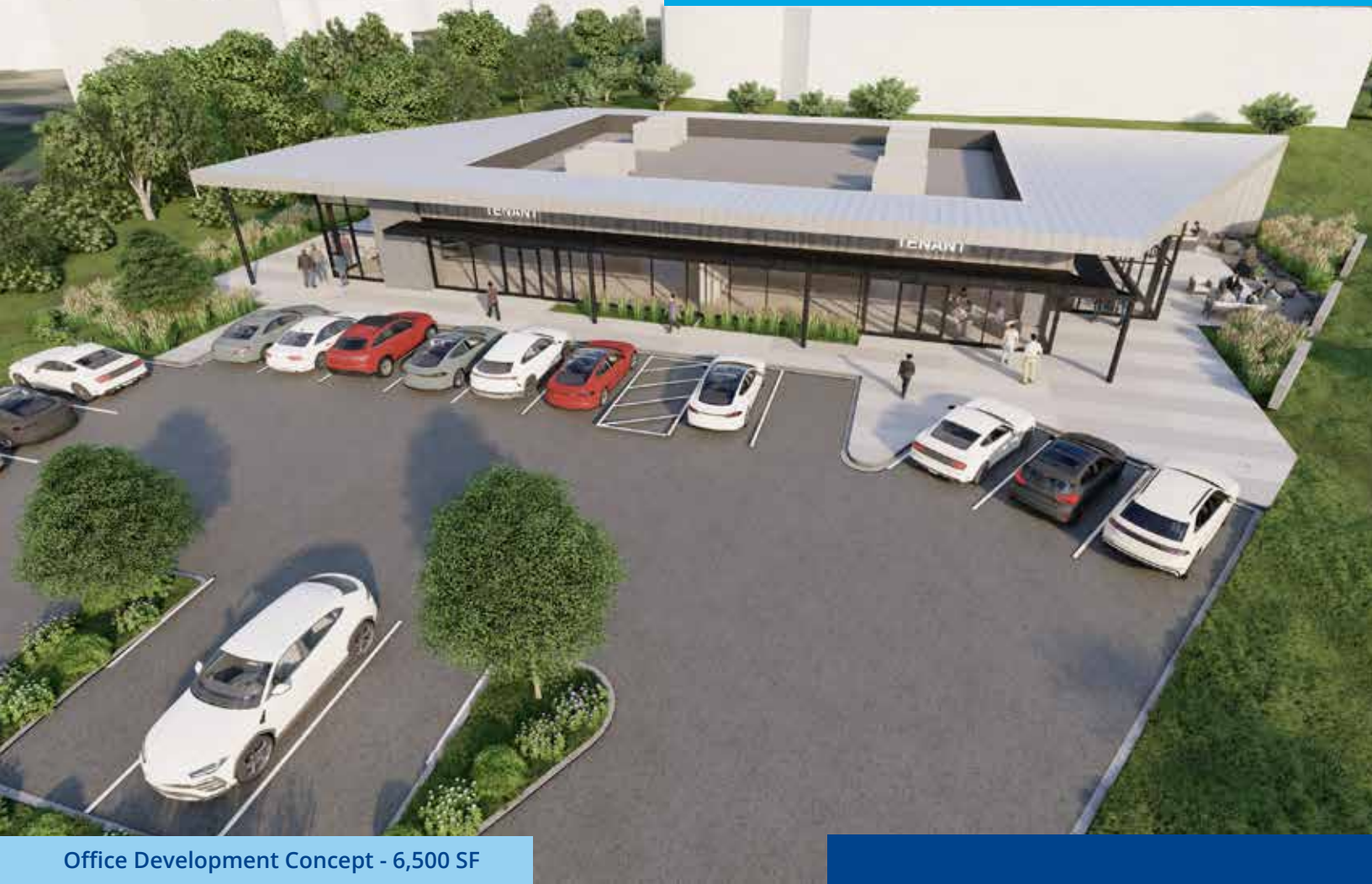
Office Development Concept - 6,500 SF