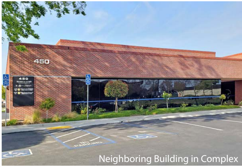
Neighboring Building in Complex