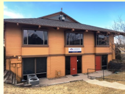
approximate floor plan sketch