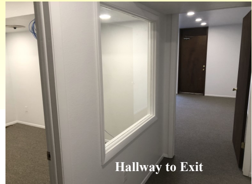
Lower Walkout Garden Level