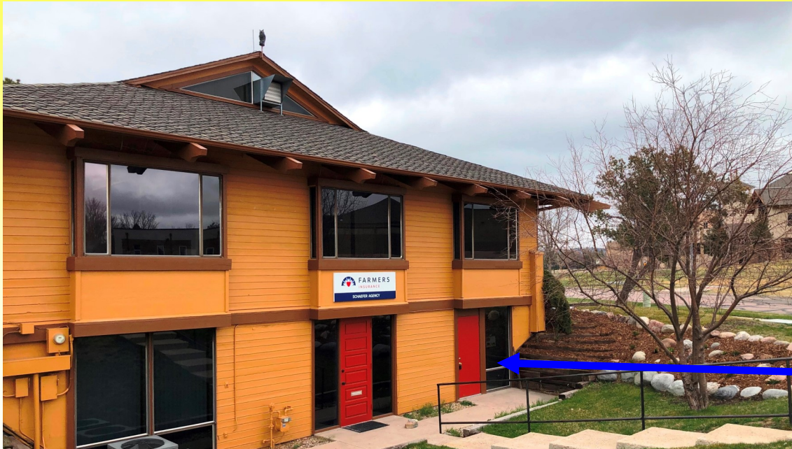
Suite A Entry

Suite A - 540 Sq. Ft. - $550/mo. Gross, Plus share of Utilities - 2-3 year Lease