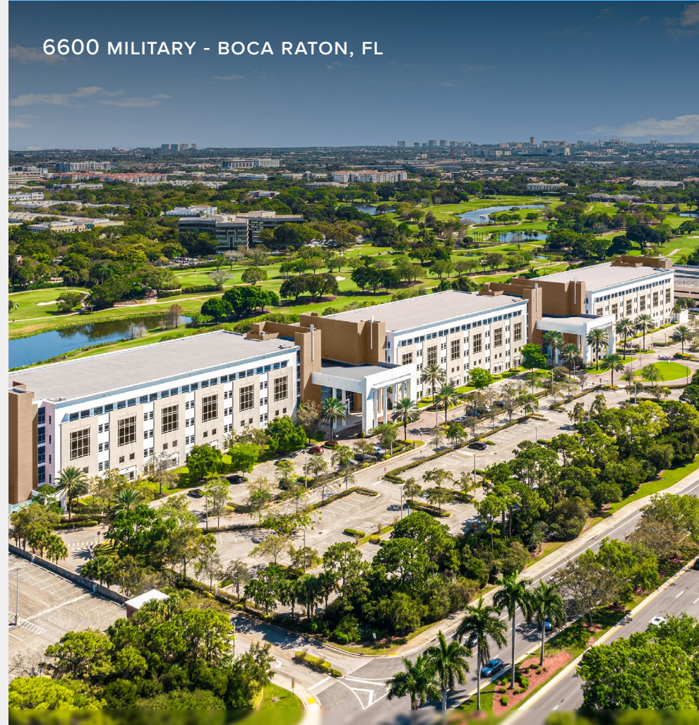
6600 MILITARY - BOCA RATON, FL