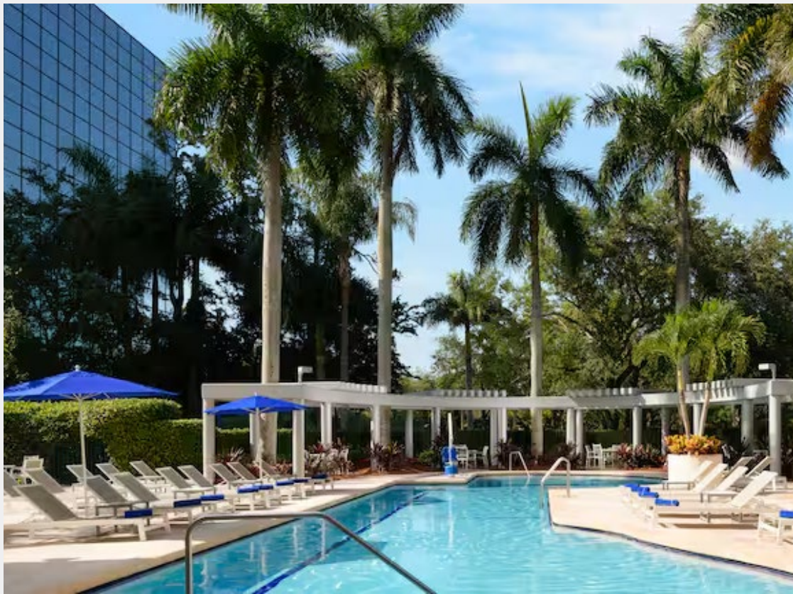
HILTON BOCA SUITES