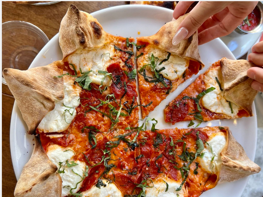
Mister O1 Extraordinary Pizza