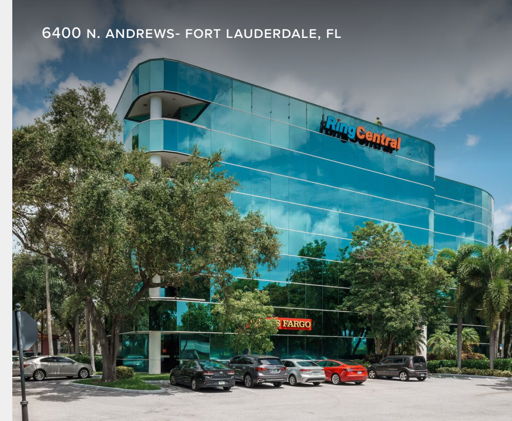
6400 N. ANDREWS- FORT LAUDERDALE, FL