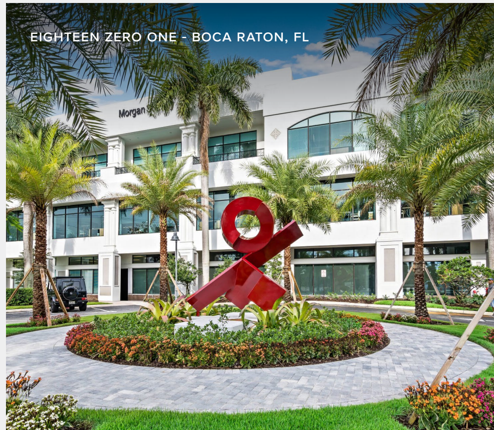
EIGHTEEN ZERO ONE - BOCA RATON, FL