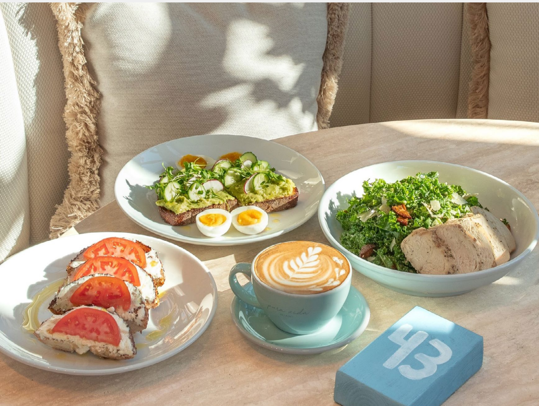
PURA VIDA MIAMI