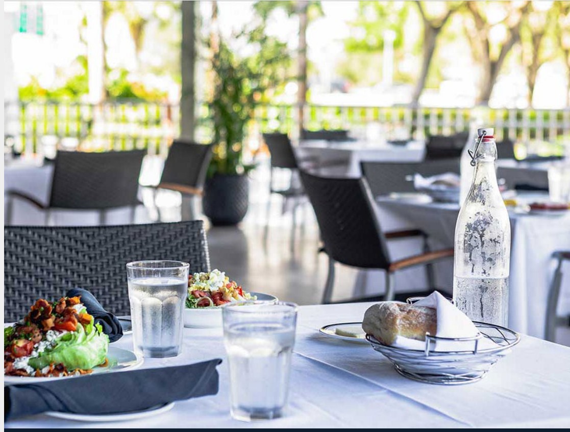
CITY FISH MARKET