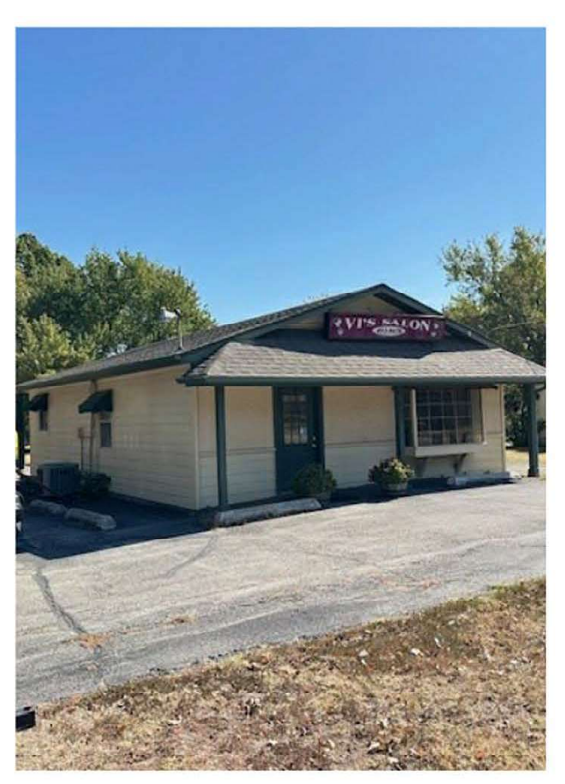
Tulsa, OK 7607 S Sheridan Rd, Tulsa, OK 74133