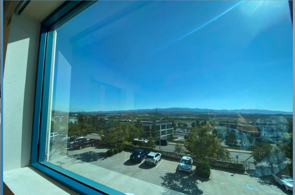
Beautiful Office Views