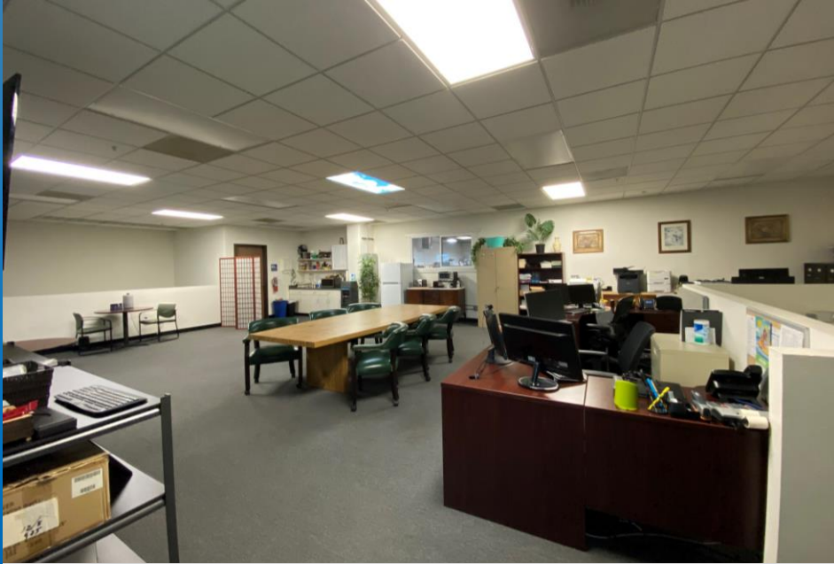
Large Bullpen + Private Restroom & Kitchenette