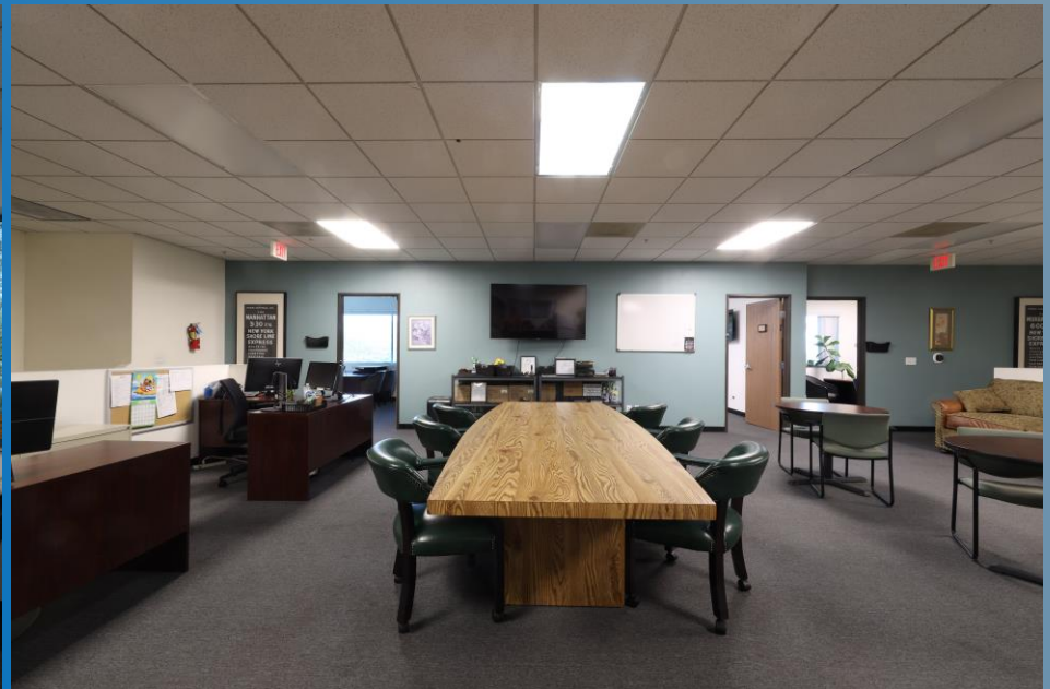
3 Large Private Offices