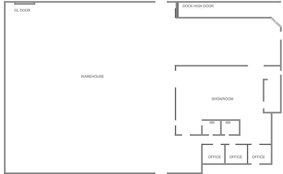
26008 Business Center Drive - (16,826 sf)