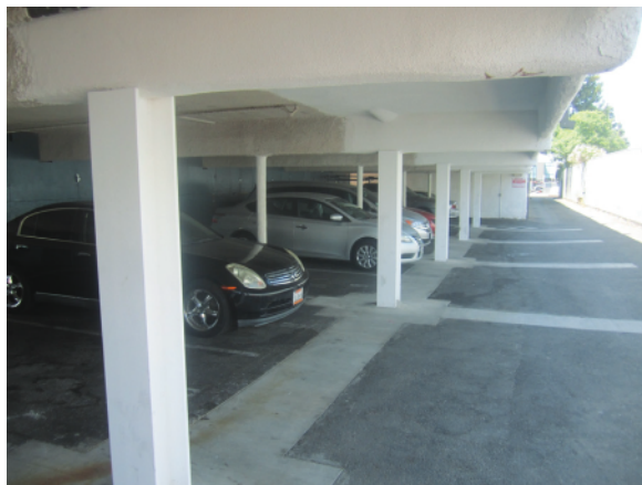
Parking, retrofit complete