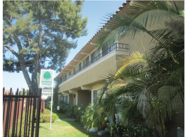
Front & yard