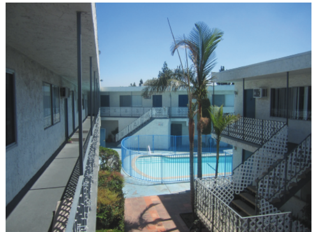
Courtyard, deck & pool