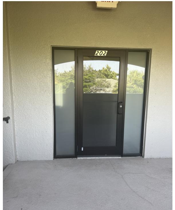
Front Entrance To Unit

LAURI ALBION JOHN ALBION O: 239.851.5492 O: 239.410.2234 lauri.albion@svn.com john.albion@svn.com FL #BK626727