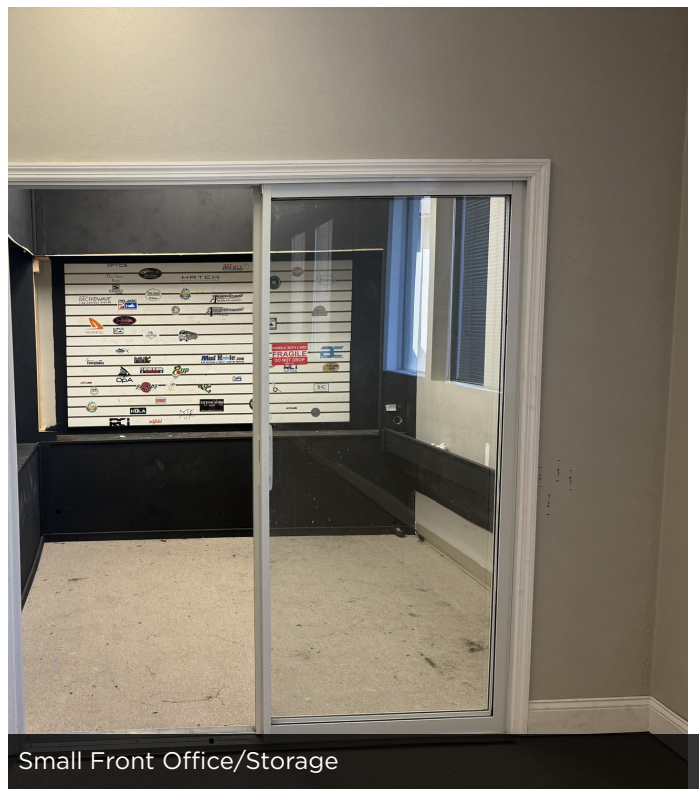
Small Front Office/Storage