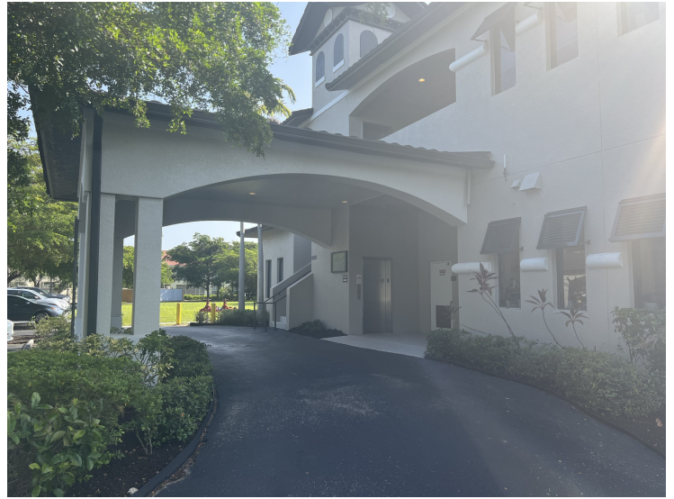
Covered Drop-Off At Stairs and Elevator