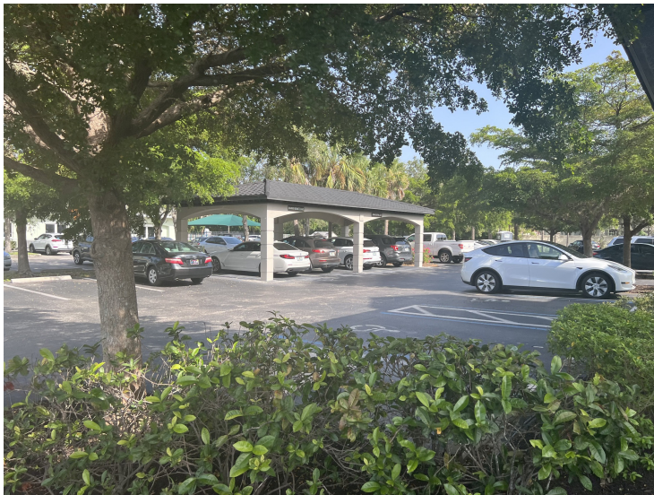
One Dedicated Parking Space