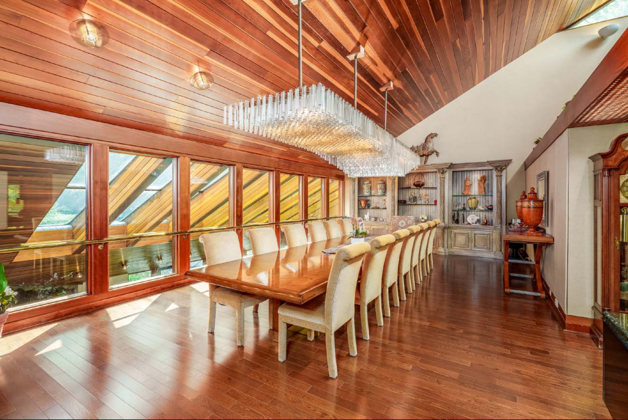
The expansive dining room can comfortably seat 16 and is placed alongside the large kitchen. The impressive dining room has a large built-in buffet and overlooks the indoor pool.