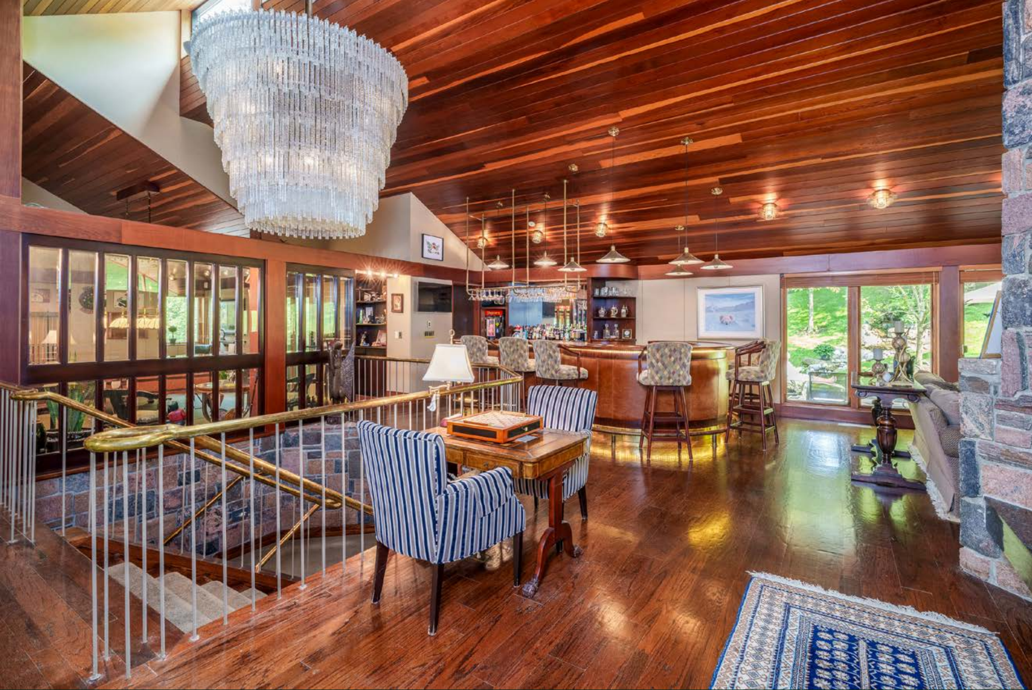
In the great room is a custom crafted bar in the shape of a question mark. The ? bar is well placed with direct access to billiard room & outdoor kitchen.