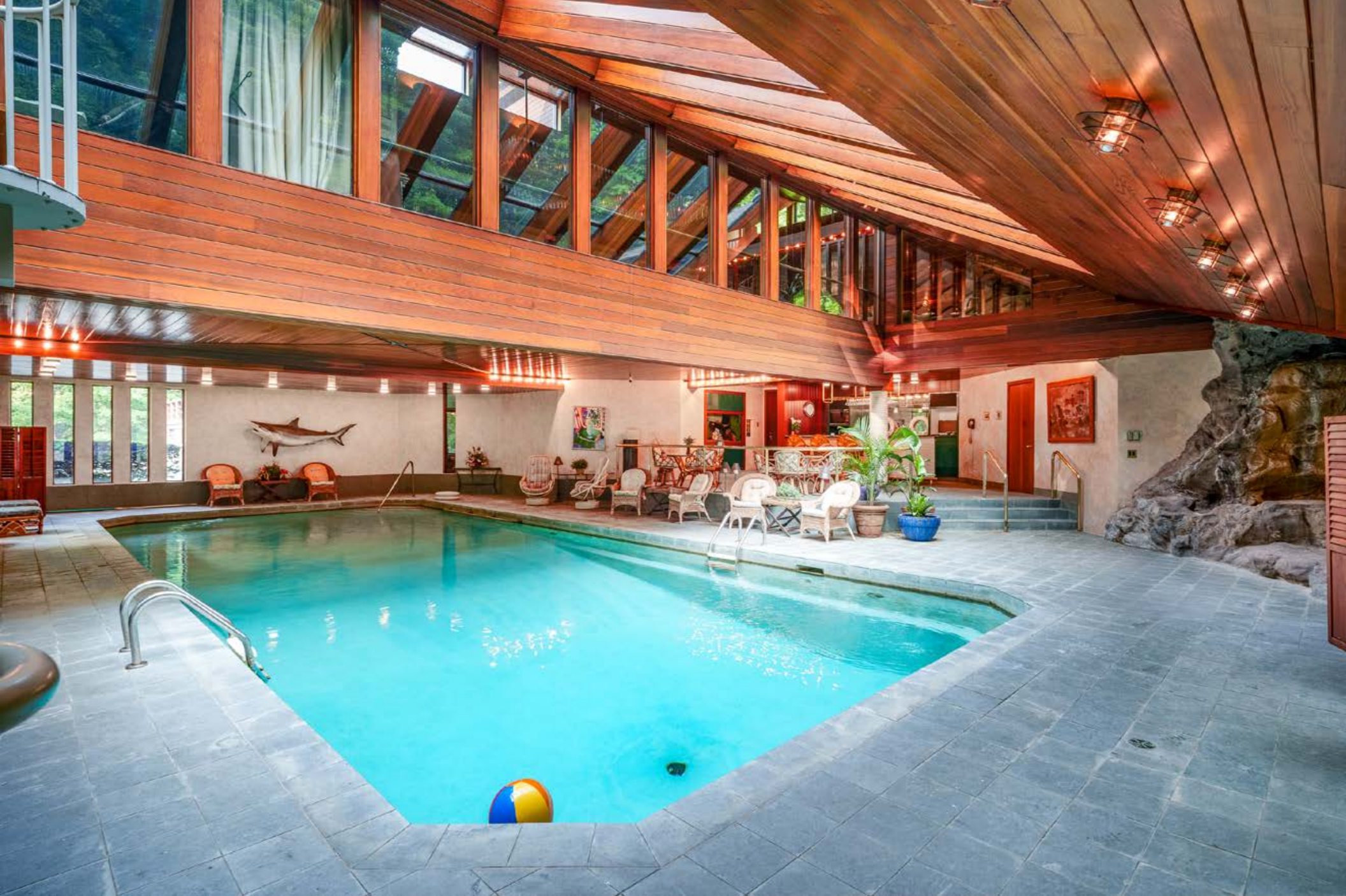
The indoor pool and spa complex has a large pool, hot tub grotto with waterfall, steam room, shower room, sauna, change rooms, powder room and a large pool bar with seating area. There is even a complete home gym!