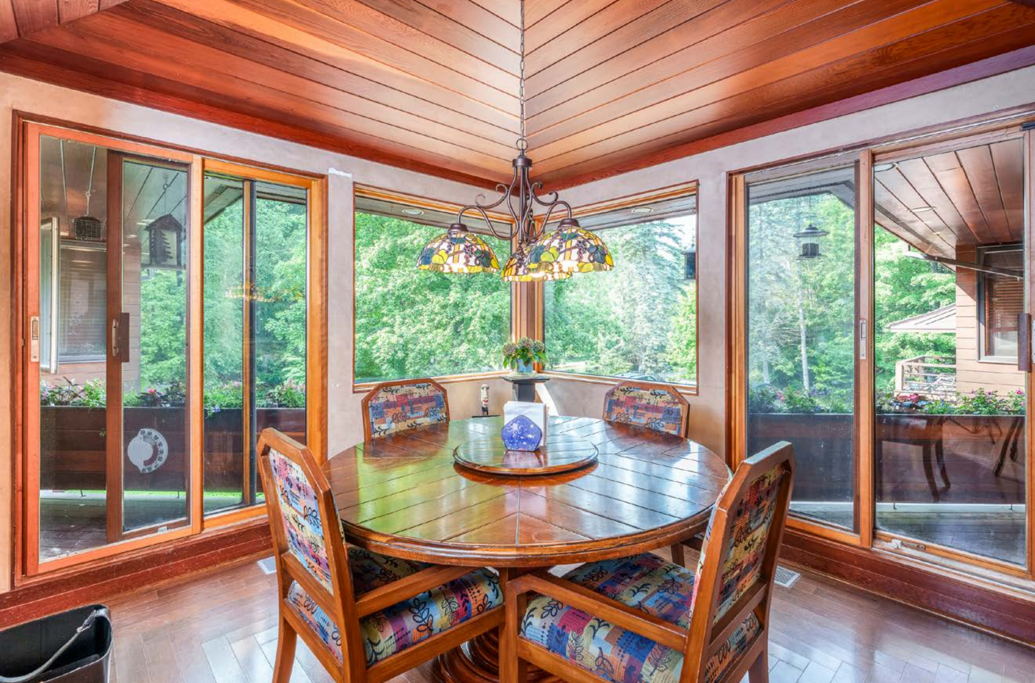
The kitchen has undergone a recent renovation and has ample storage, 2 breakfast bars, an order desk and a bright breakfast room which overlooks the front courtyard.