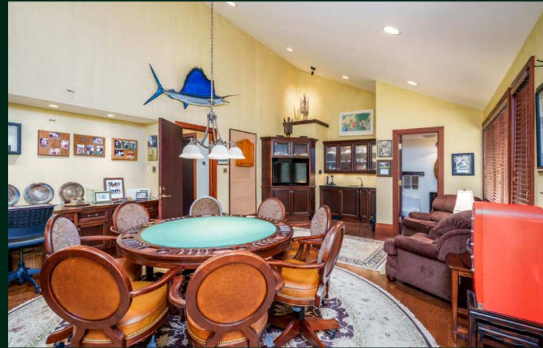
The home has multiple games rooms which could also be used as private offices, TV rooms and lounges. The main games room even has its own loft space.