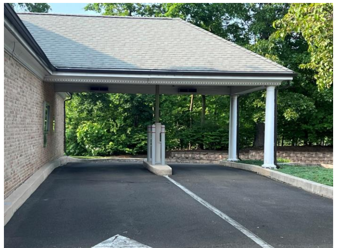
Covered Porte-Cochere Entrance