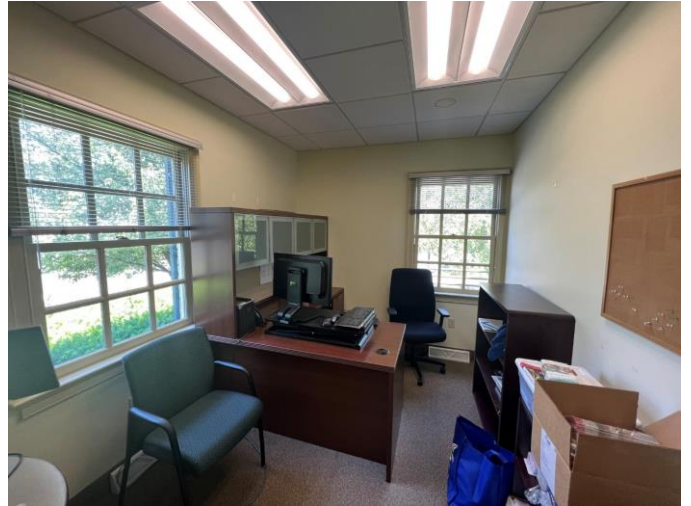
Windowed Private Office