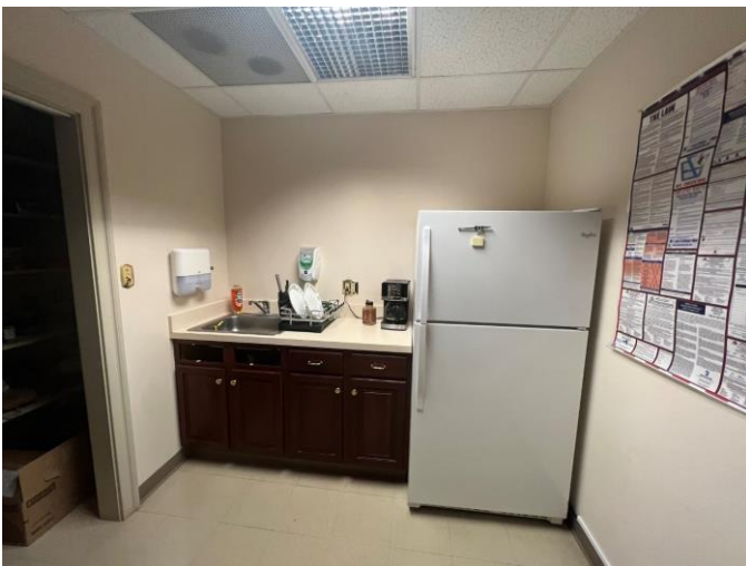
Staff Break Room / Kitchen