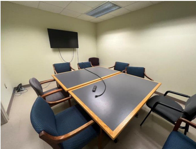
Conference Room with AV Display