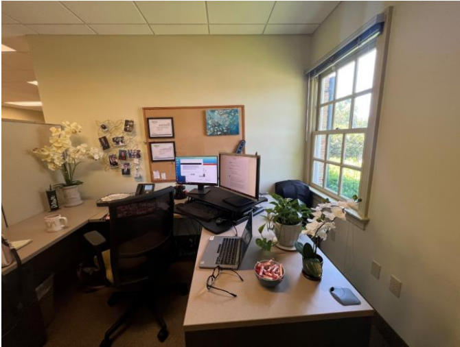
Executive Private Office