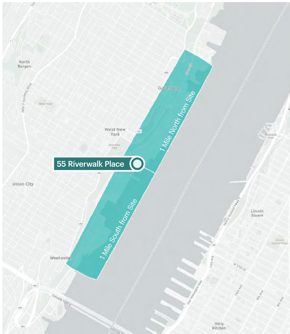
Esri 2025 estimates