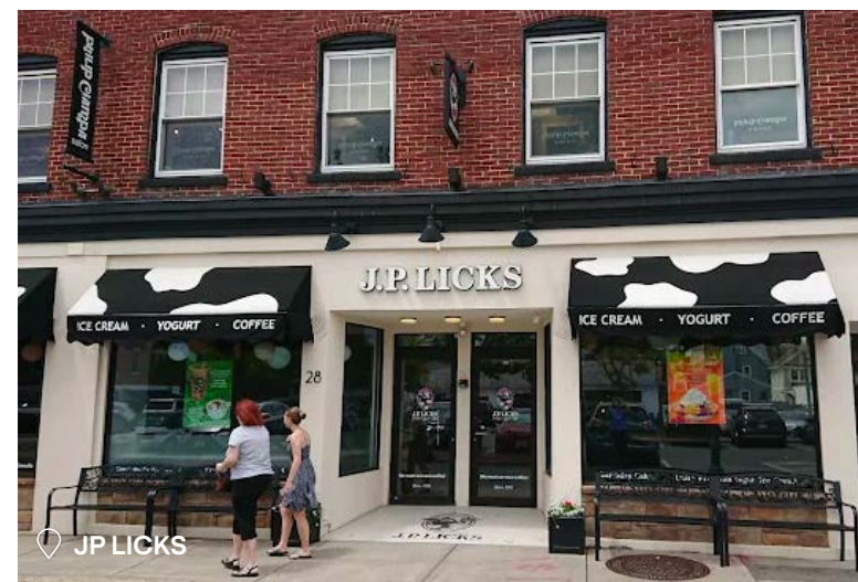
📍 JP LICKS