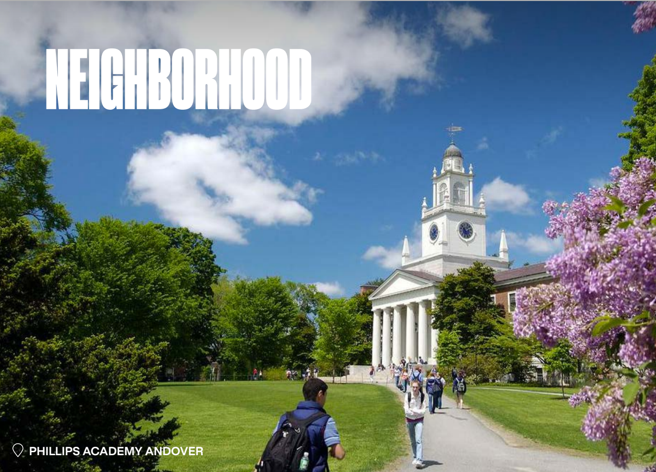
📍 PHILLIPS ACADEMY ANDOVER