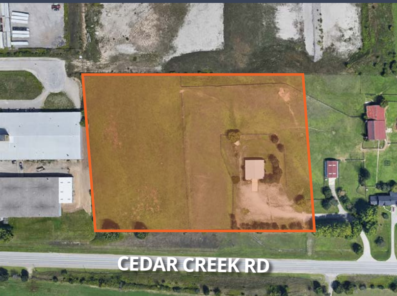
CEDAR CREEK RD