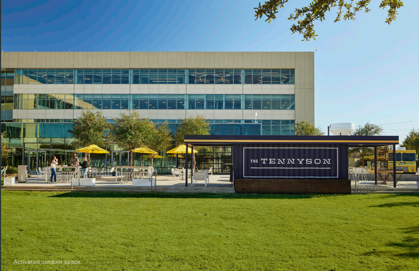
Activated outdoor space

Year-round food trucks can be found outside near the greenspace where you can enjoy lunch on the patio.