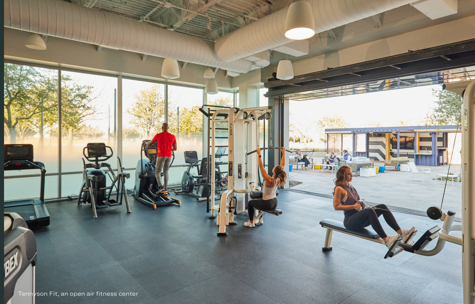
Tennyson Fit, an open air fitness center

Host a meeting in our Speakeasy designed for comfort & to inspire creativity.