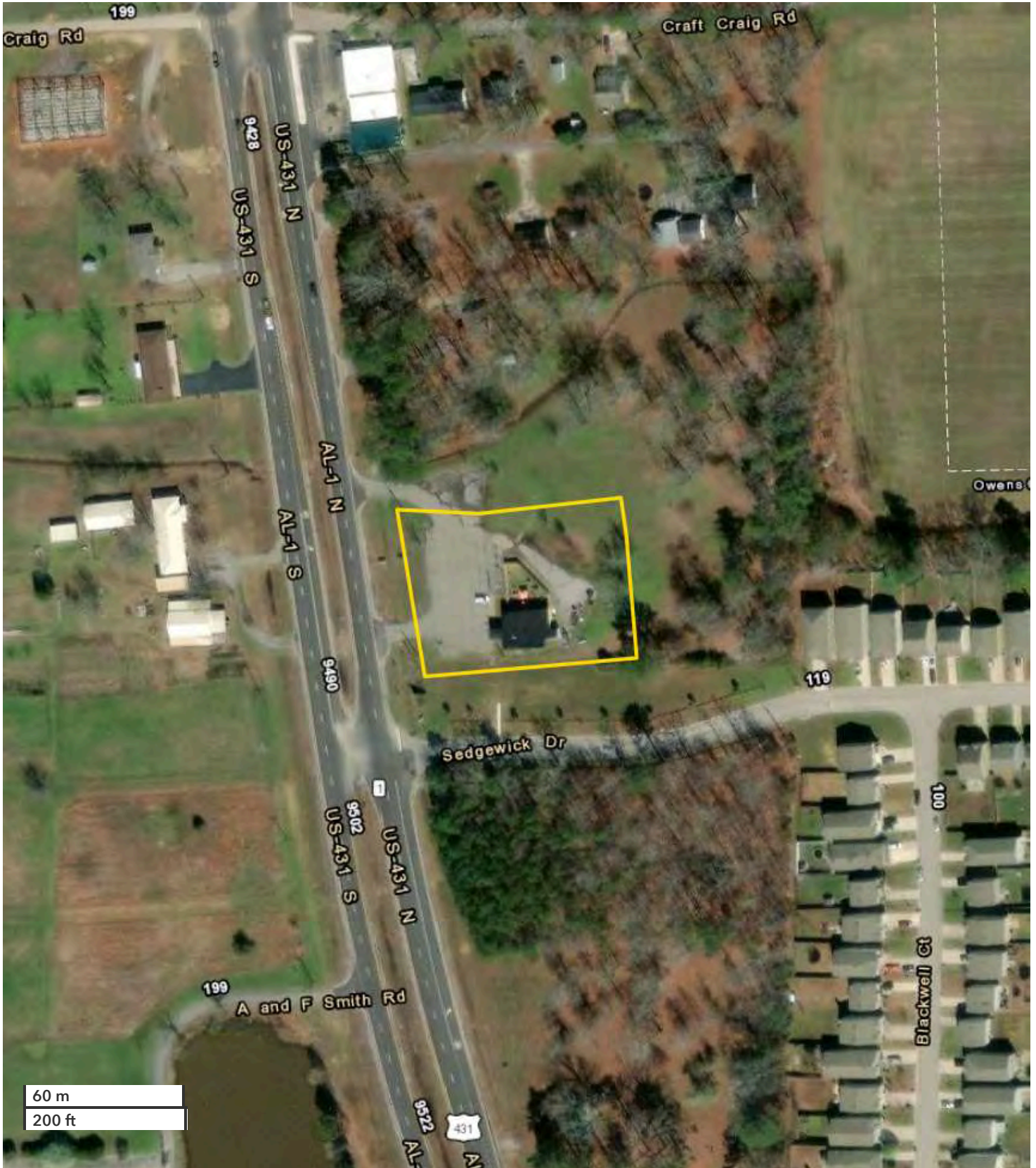
All boundary lines noted in pictures, aerials or maps should be considered estimates and not relied on as legal documents or descriptions.