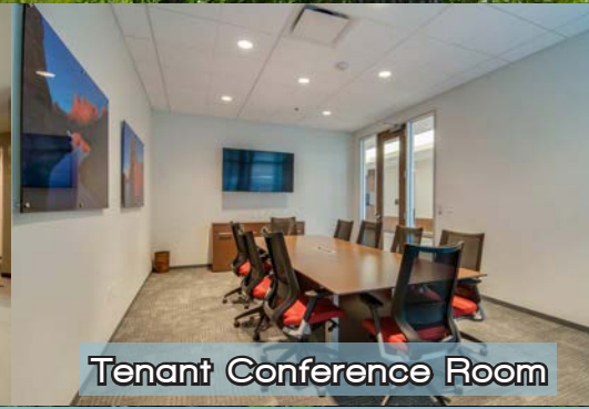
Tenant Conference Room