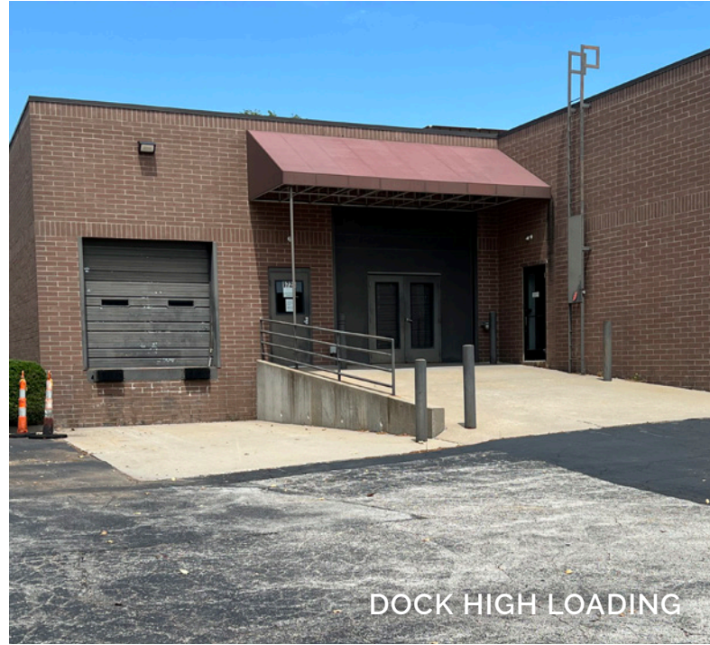
DOCK HIGH LOADING