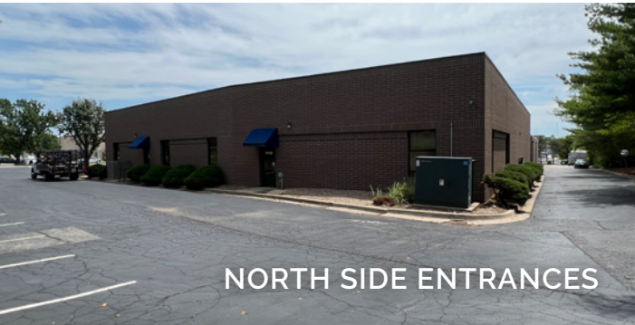
NORTH SIDE ENTRANCES