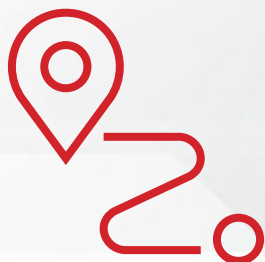
Easy Access to I-680