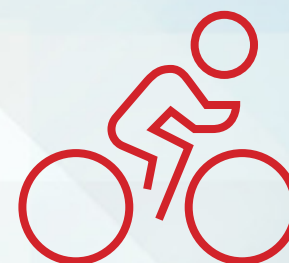
Steps from Bay Club