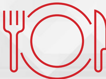
Proximity to Shops/Dining