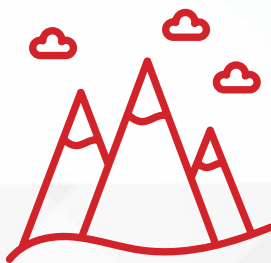
Mt. Diablo Views