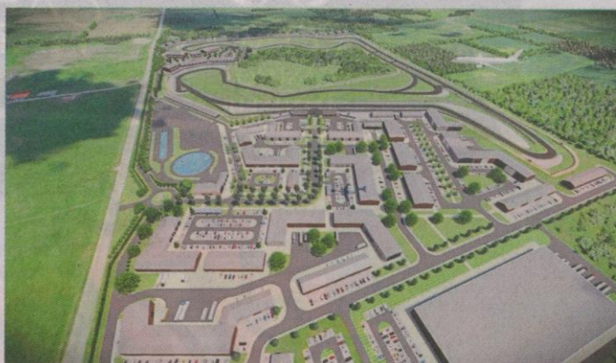
Oro Station image

The recent approval clears the way for construction of a 4.1 kilometre FIA Grade 3 circuit.