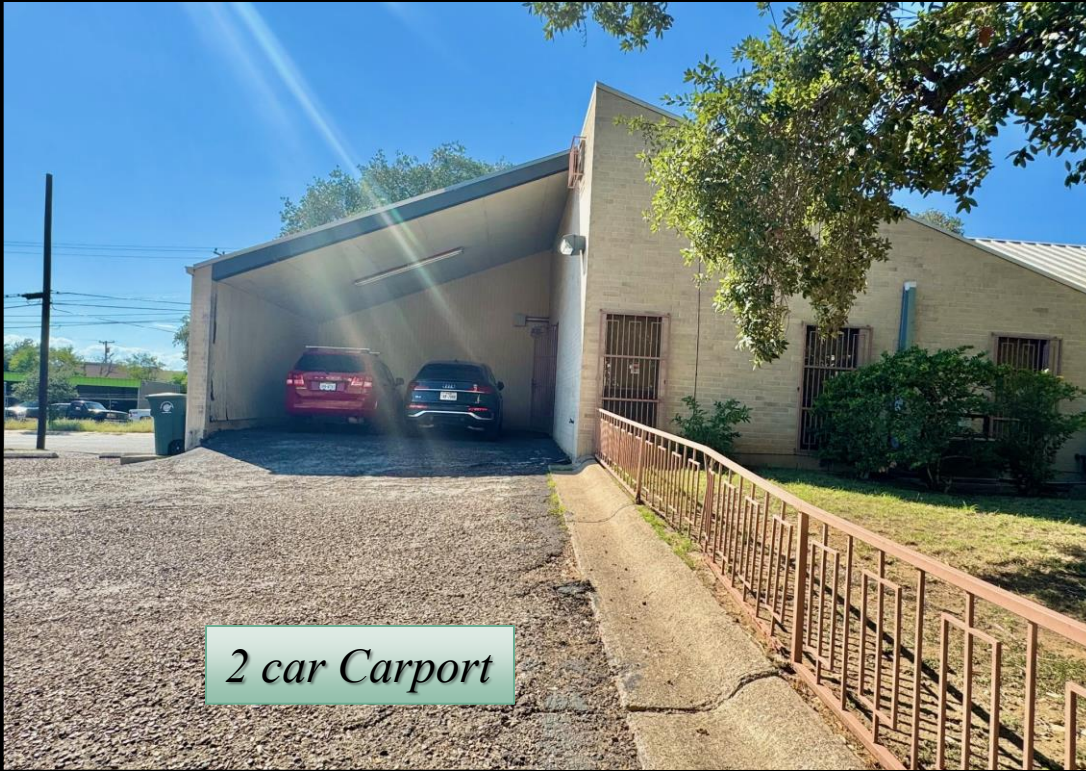
2 car Carport