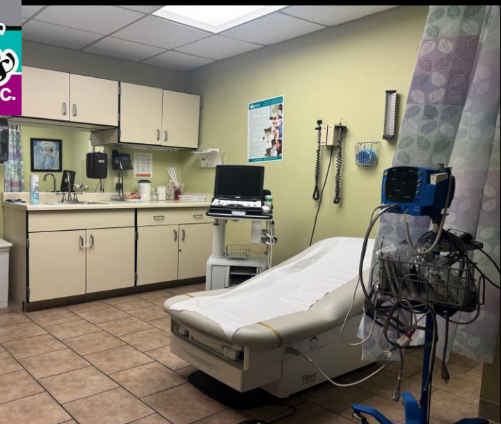
3 Exam Rooms