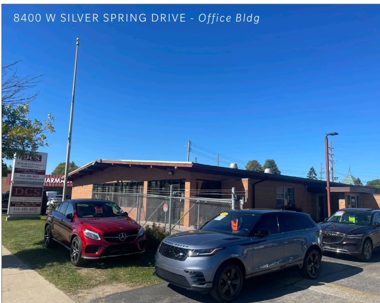
8400 W SILVER SPRING DRIVE - Office Bldg