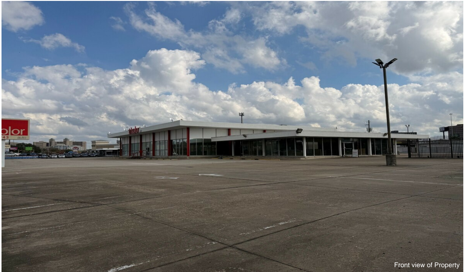
Front view of Property