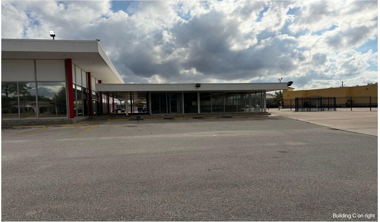
Building C on right