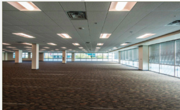
Interior Office Space