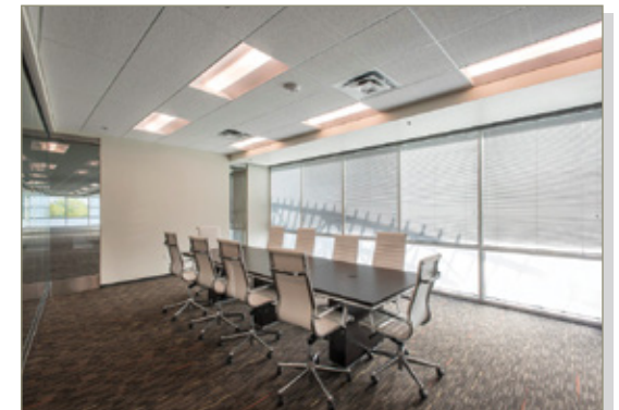
Conference Room in Second Floor Spec Suite