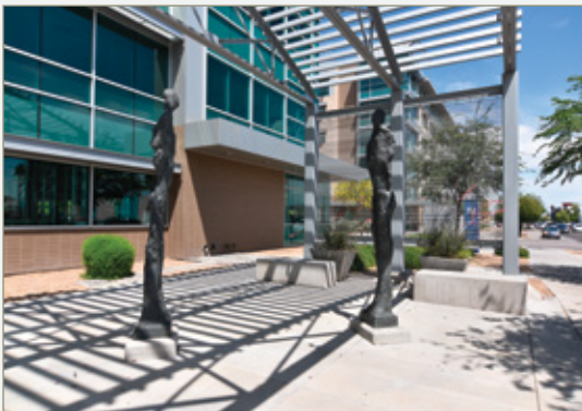
Art Sculptures Facing Seventh Avenue