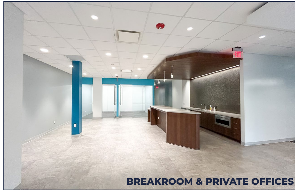
BREAKROOM & PRIVATE OFFICES

NO WARRANTY OR REPRESENTATION, EXPRESS OR IMPLIED, IS MADE AS TO THE ACCURACY OF THE INFORMATION CONTAINED HEREIN, AND THE SAME IS SUBMITTED SUBJECT TO ERRORS, OMISSIONS, CHANGE OF PRICE, RENTAL OR OTHER CONDITIONS, PRIOR SALE, LEASE OR FINANCING, OR WITHDRAWAL WITHOUT NOTICE, AND OF ANY SPECIAL LISTING CONDITIONS IMPOSED BY OUR PRINCIPALS. NO WARRANTIES OR REPRESENTATIONS ARE MADE AS TO THE CONDITION OF THE PROPERTY NOR ANY HAZARDS CONTAINED THEREIN ARE ANY TO BE IMPLIED.