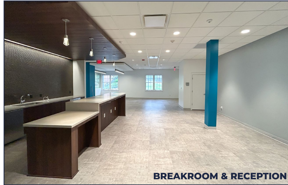
BREAKROOM & RECEPTION