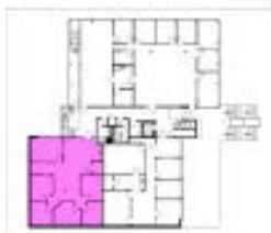
First Floor Inset