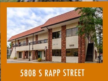
5808 S RAPP STREET