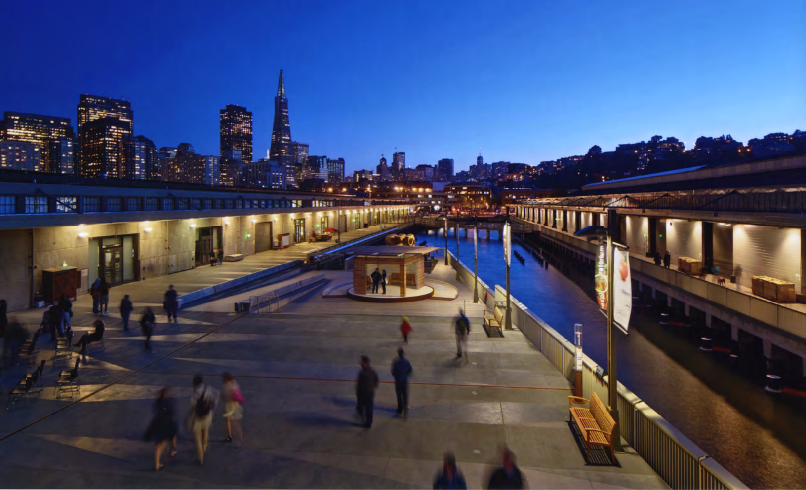
Above: View from between Piers 15 and 17 towards Telegraph Hill and the financial district.