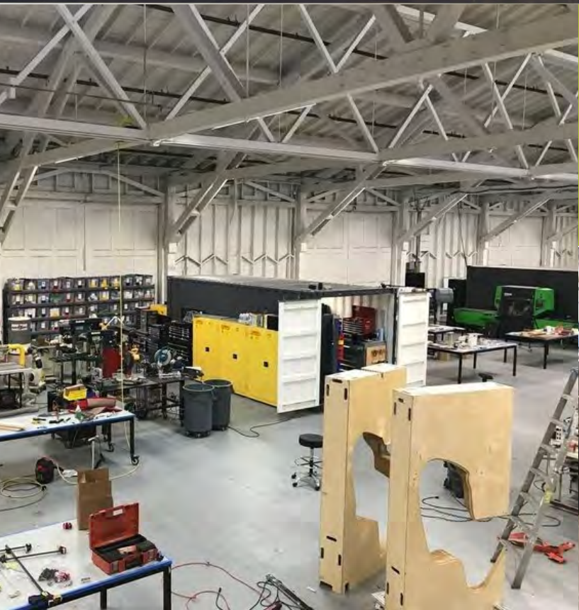
Left and Below: Views of the interior space of Suite 700, Pier 17, highlighting its well lit, column free, spaciousness.