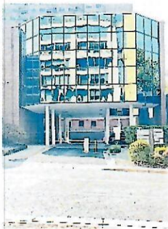
View of building

500 S.F. Office + 1 Parking Space - For Lease