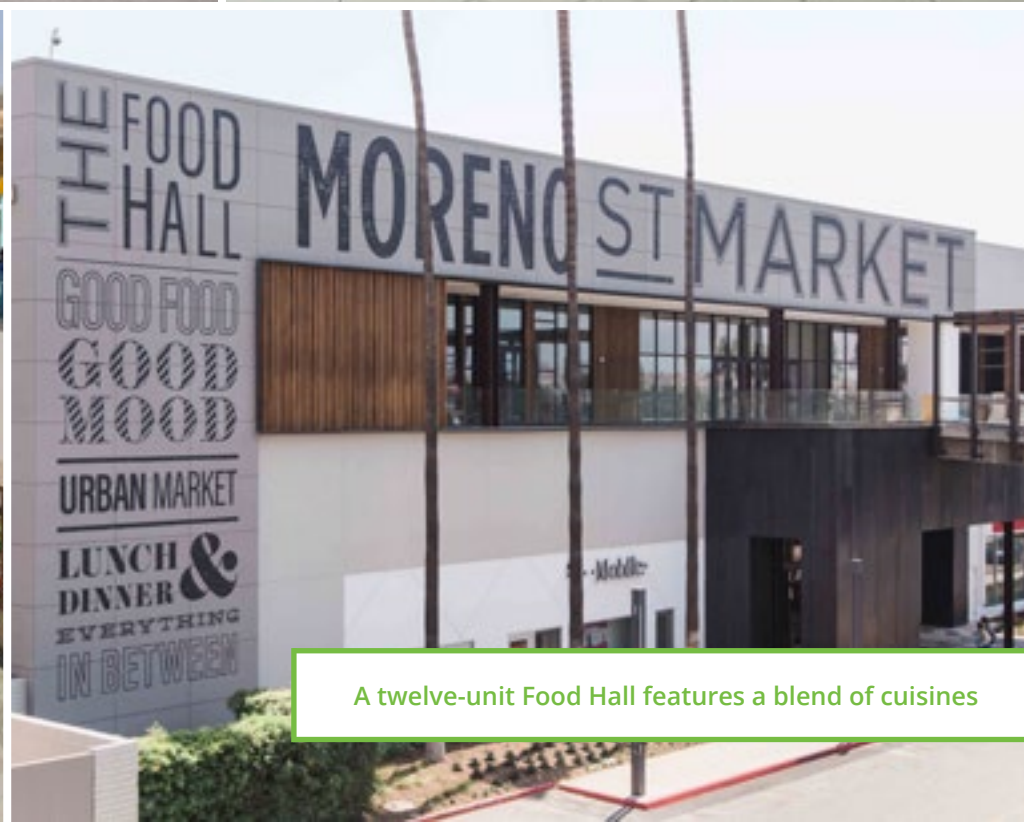
A twelve-unit Food Hall features a blend of cuisines