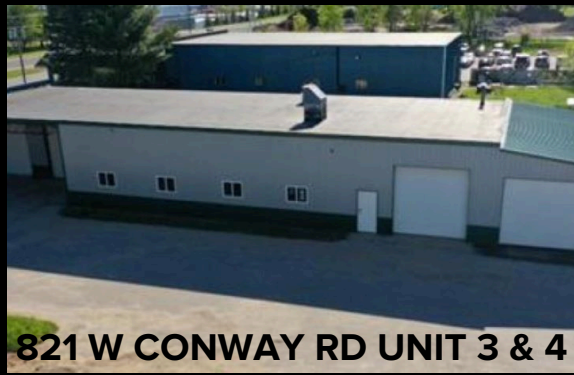
821 W CONWAY RD UNIT 3 & 4