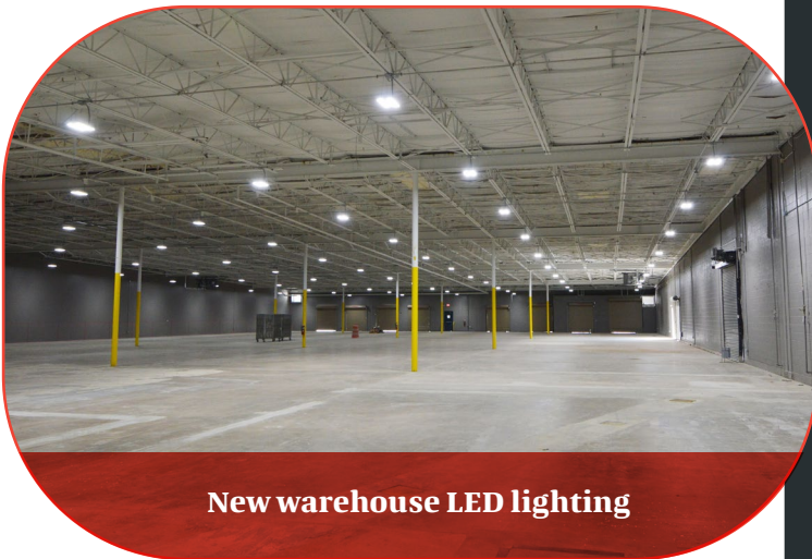
New warehouse LED lighting