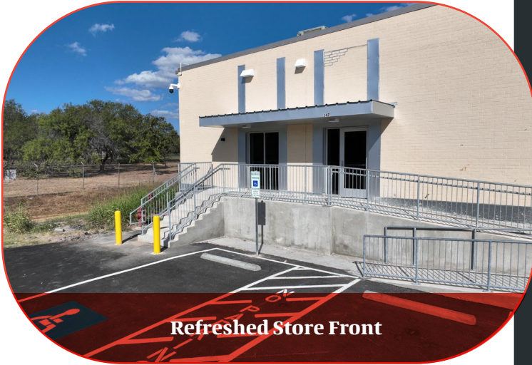
Refreshed Store Front