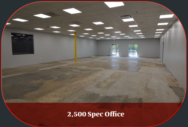
2,500 Spec Office