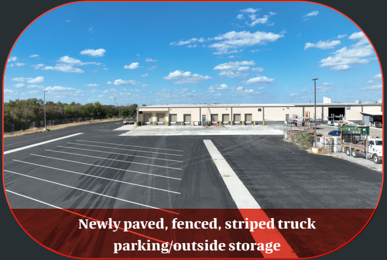
Newly paved, fenced, striped truck parking/outside storage