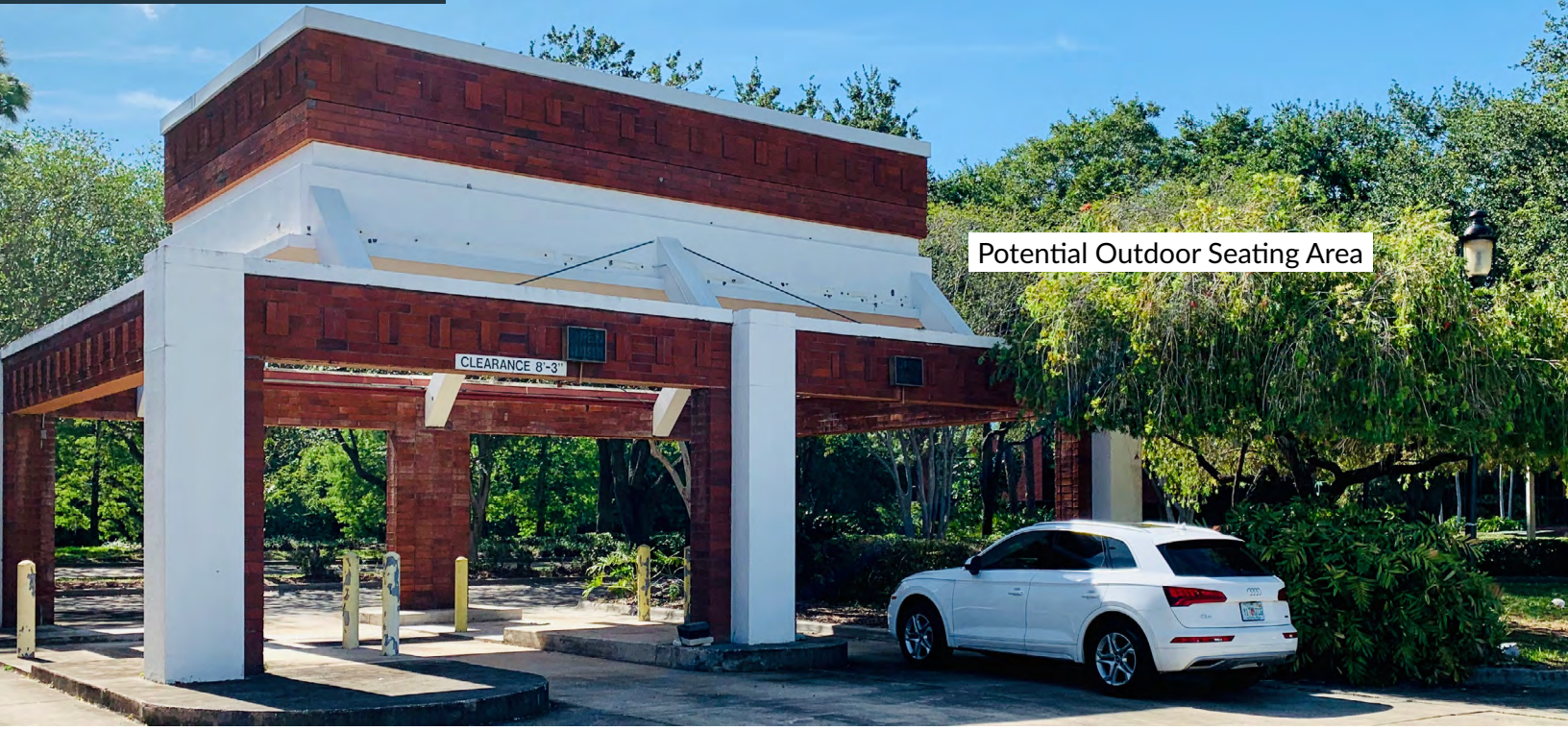
Potential Outdoor Seating Area

5555 Roosevelt Blvd., Clearwater, FL 33760