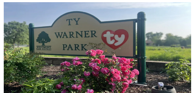
Ty Warner Park: