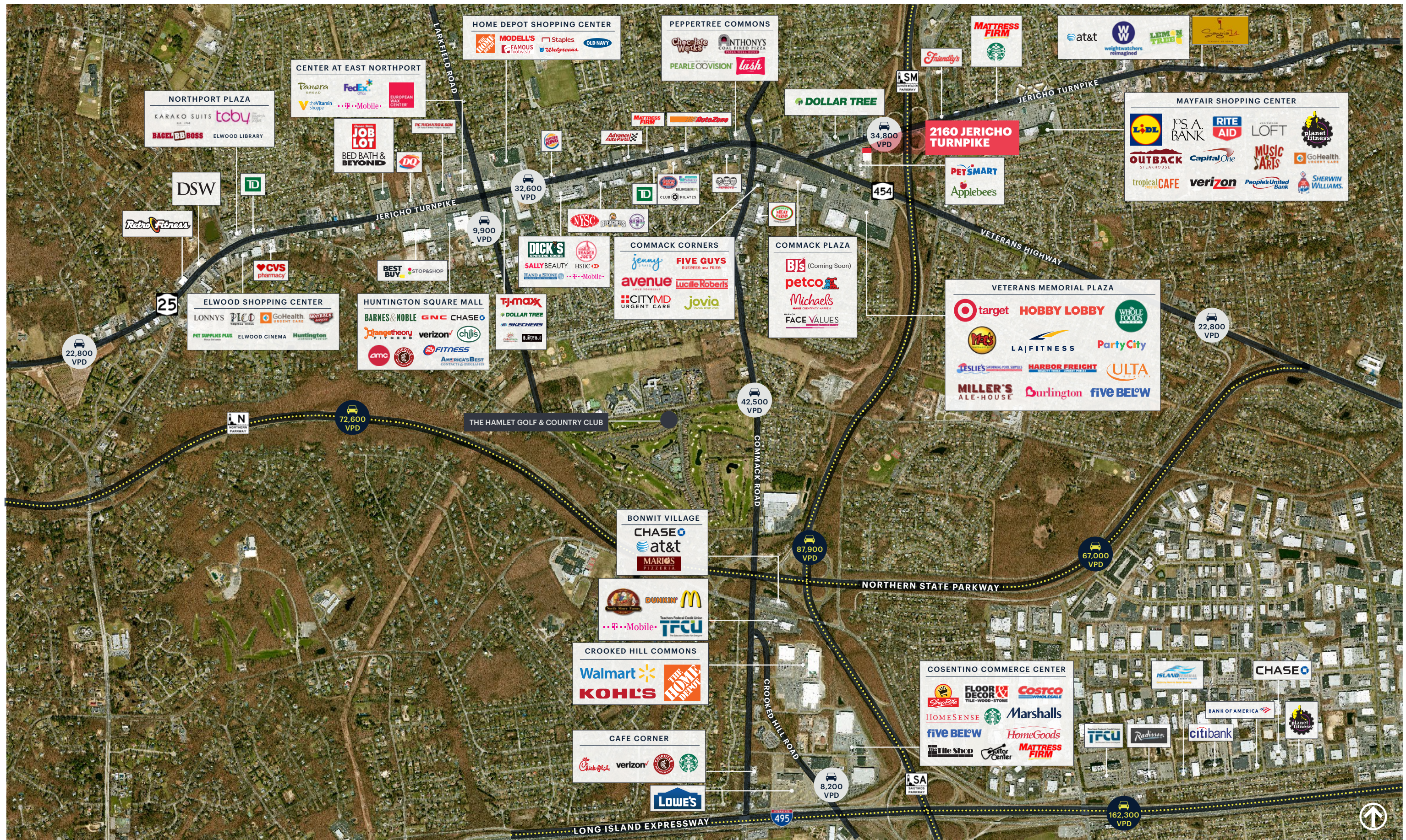
2160 JERICHO TURNPIKE COMMACK, NEW YORK