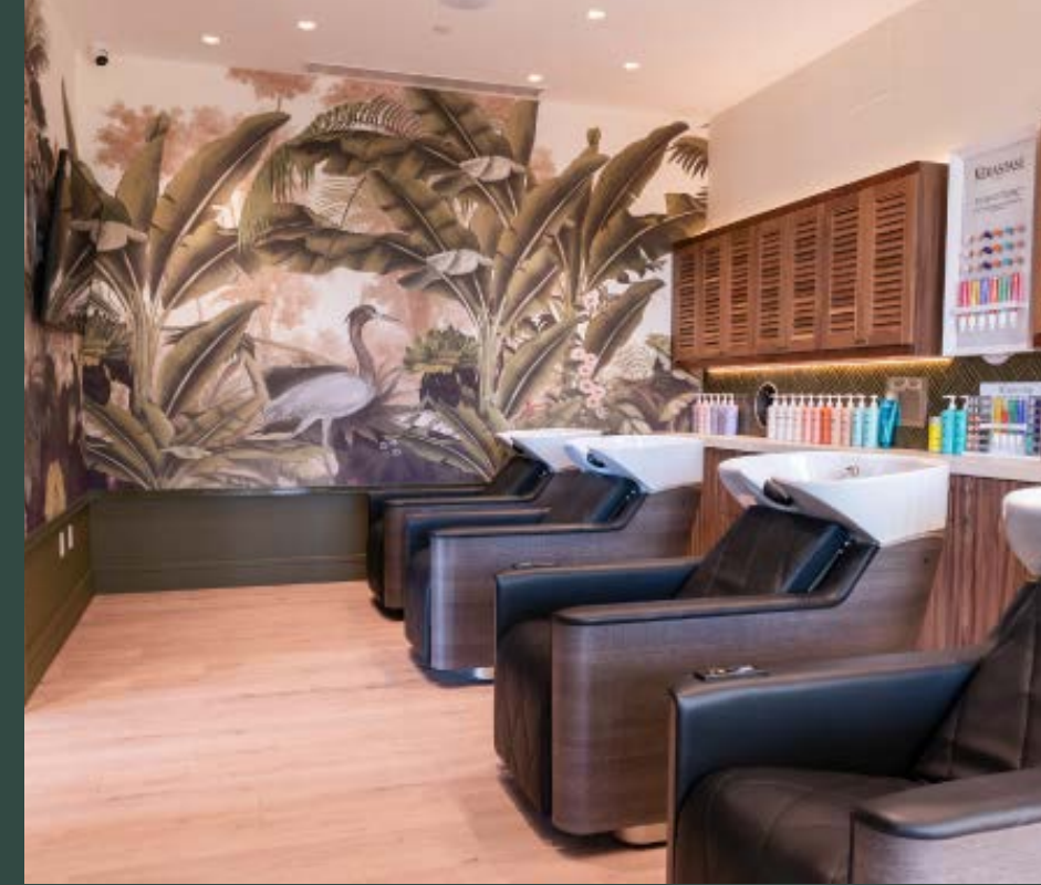
PETER ALEXANDER SALON