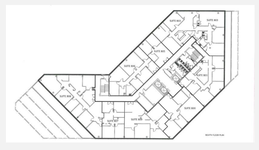
PH FLOOR FEATURES BALCONIES