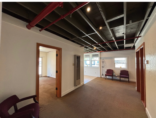
Unit A Office Space