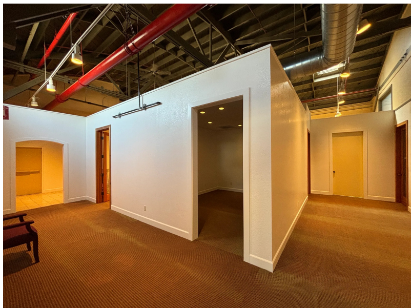
Unit A Office Space