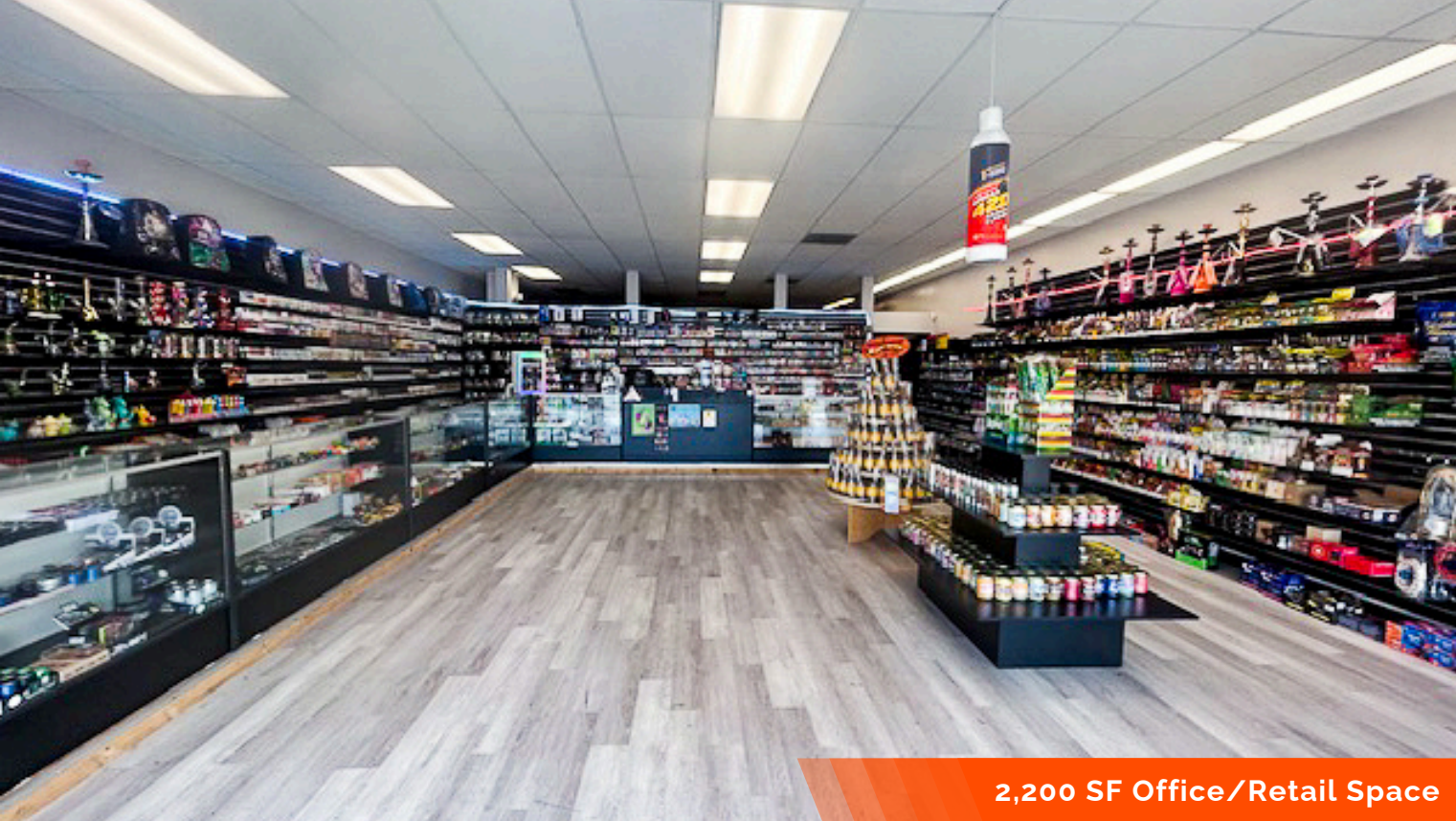
2,200 SF Office/Retail Space

2,200 SF office/retail space available in a high-traffic area.