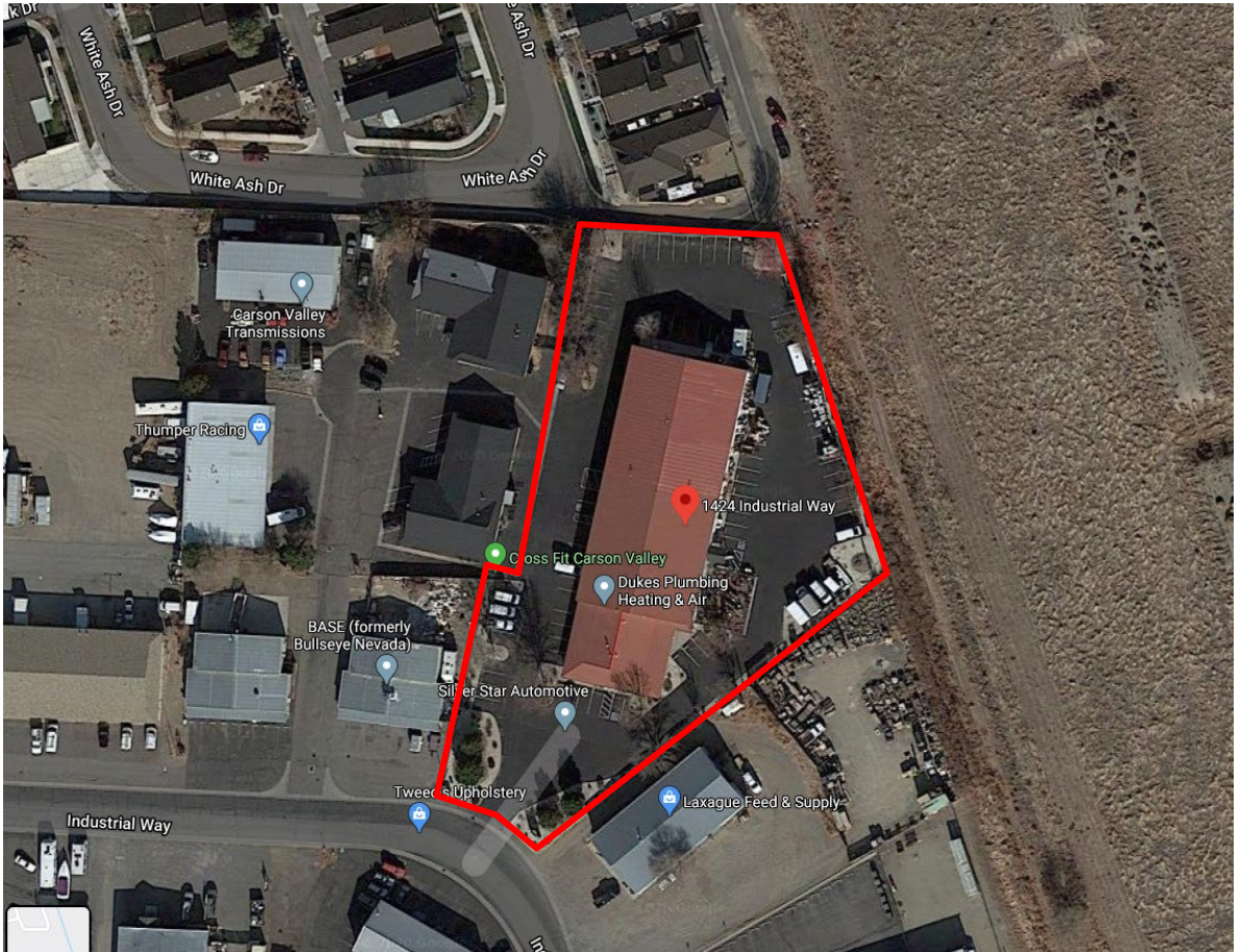
Aerial of Site

1424 & 1426 Industrial Way, Gardnerville, Nevada