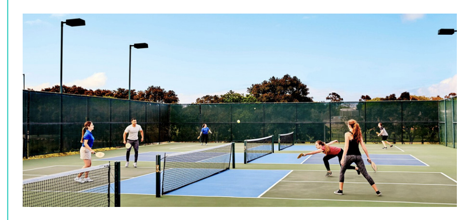
Price & Terms Negotiable Contact broker for details